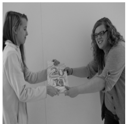
Students fight over remaining copies of the yearbooks for sale...where is yours?

So, to make sure that you don't miss out on these memories, pick up a yearbook order form soon. There is a limited number of yearbooks ordered each year and there are only fifty left so hurry up and get yours.